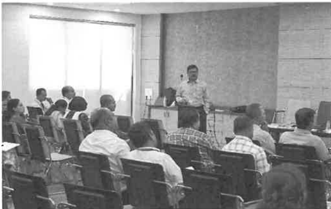
Session-III: Outcome- based Teaching-Learning