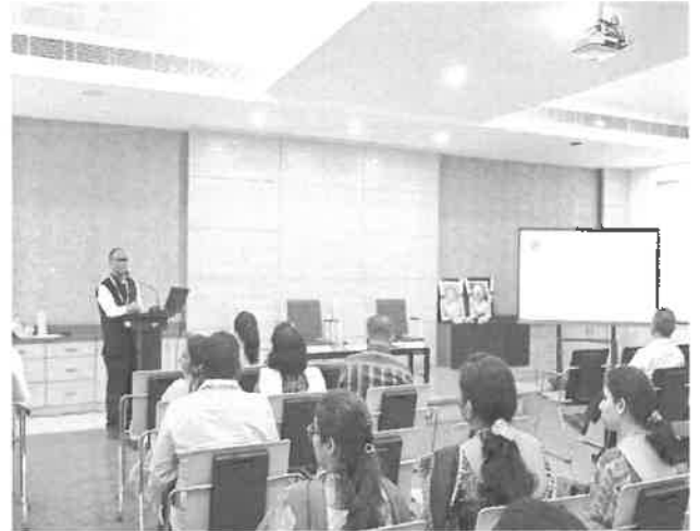
Session-II: Outcome- based Curriculum