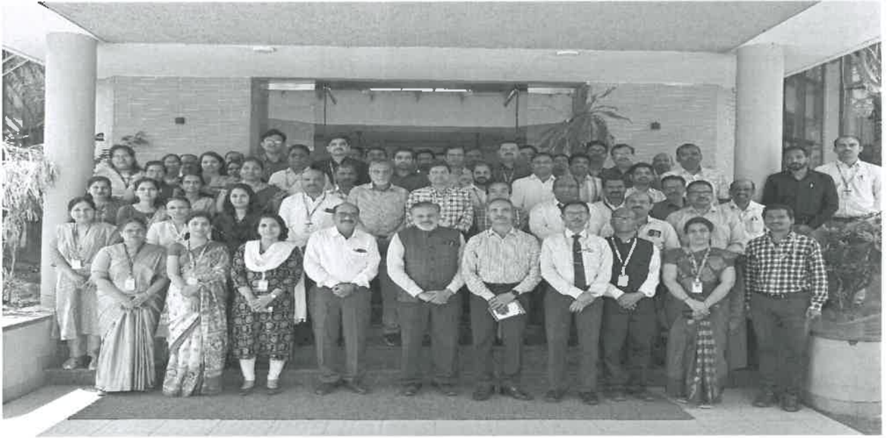
Glimpses of the Faculty Development Program