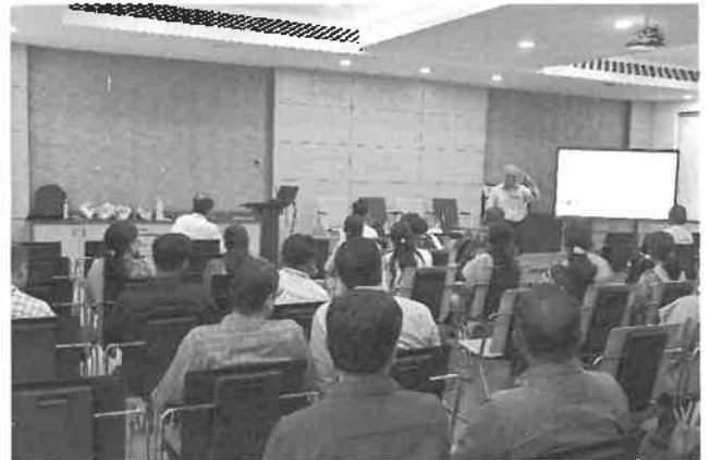
Session-IV: Outcome- based Assessment