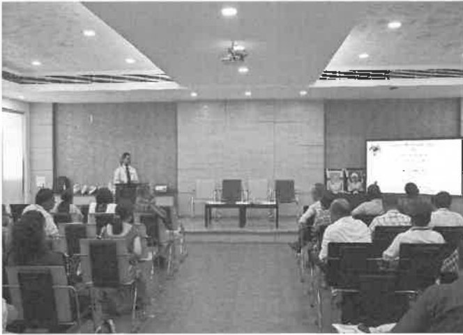
Session-I: Revised NBA Accreditation framework